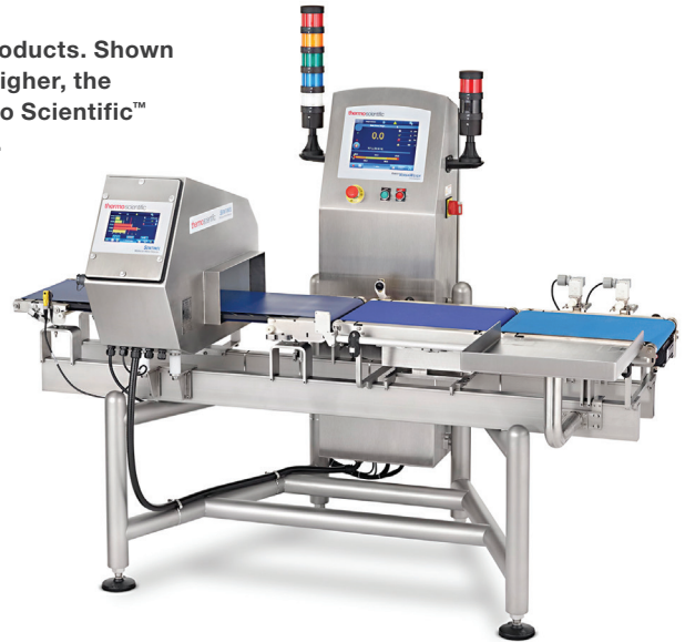
Thermo Scientific™ Versa Chain and Thermo Scientific™ Sentinel™ 3000 checkweigher combination system

Learn more at thermofisher.com/productinspection