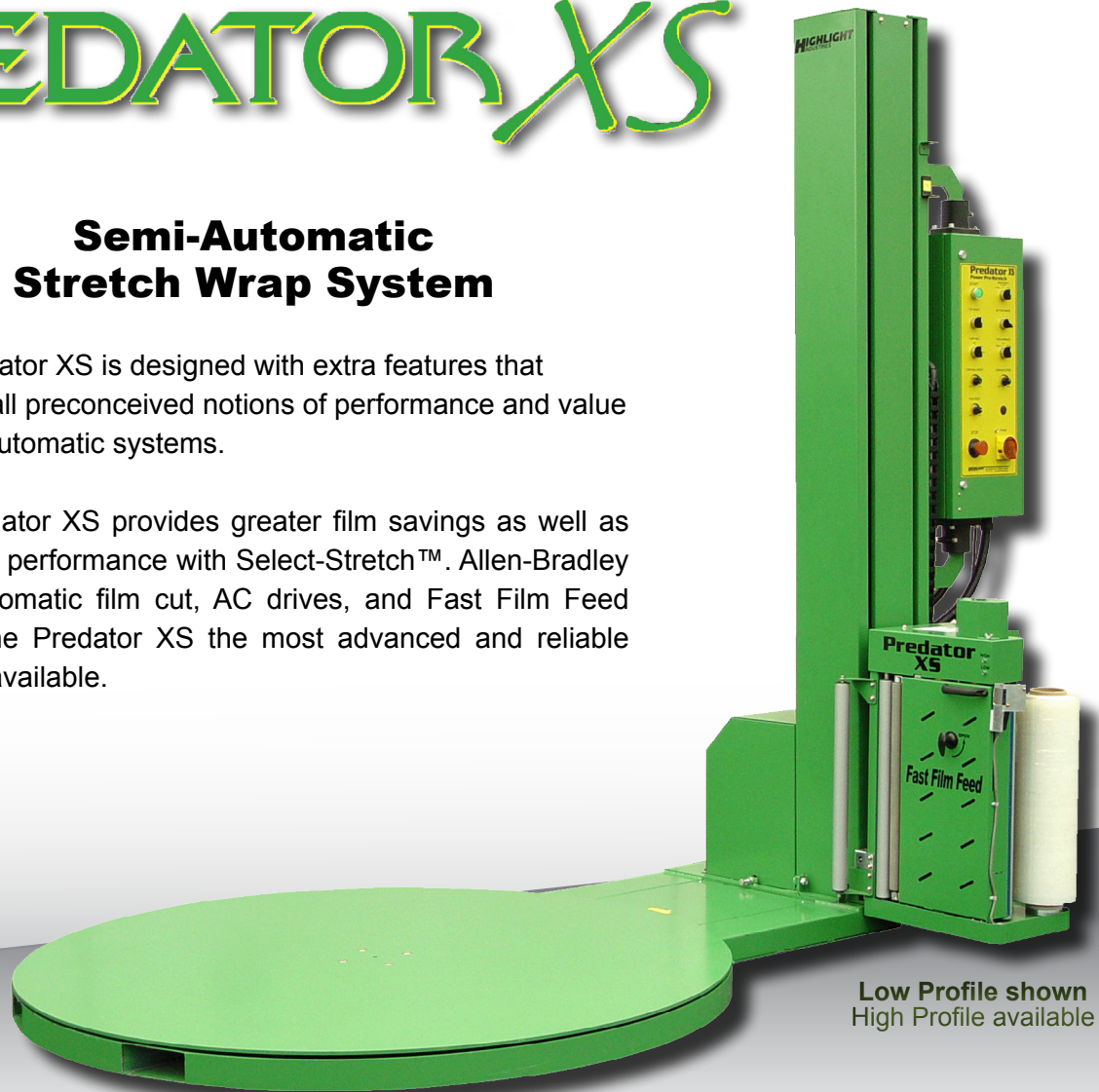
Low Profile shown High Profile available

The Predator XS provides greater film savings as well as improved performance with Select-Stretch™. Allen-Bradley PLC, automatic film cut, AC drives, and Fast Film Feed makes the Predator XS the most advanced and reliable solution available.