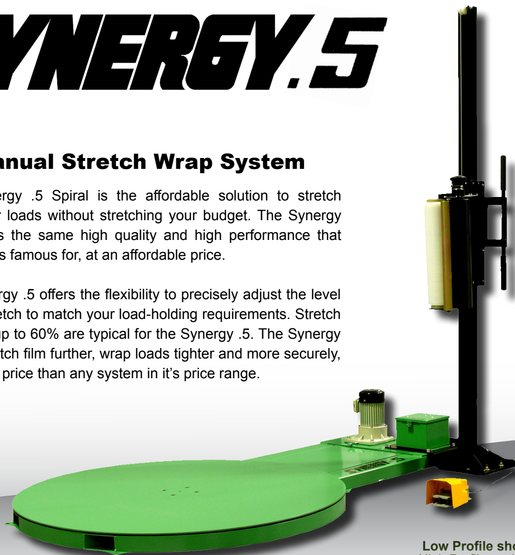
Low Profile shown High Profile available

The Synergy .5 offers the flexibility to precisely adjust the level of film stretch to match your load-holding requirements. Stretch levels of up to 60% are typical for the Synergy .5. The Synergy .5 will stretch film further, wrap loads tighter and more securely, at a lower price than any system in it's price range.